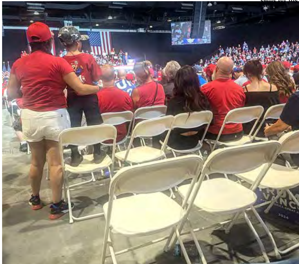
Empty seats during a Trump rally with Donald in full flow and below left, heading to the exit doors.

THE NORTH hall of the Expo World Market Center, Las Vegas, can hold 6,000 people. When Trump appeared there on Friday more than half of the floor space had been curtained off, meaning, in my rough estimation, around 2,500-3,000 people came to hear the former President speak. This would make sense. The capacity at the Linda Ronstadt Music Hall in Tuscon, where he appeared the day before, has a seating capacity of 2,195. This appears to be the sweet spot these days for the Trump campaign when it comes to picking venues - big