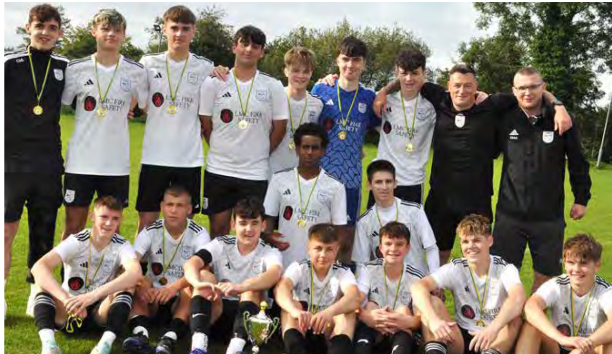
The Letterkenny Rovers team who defeated Milford on Sunday in Ramelton.