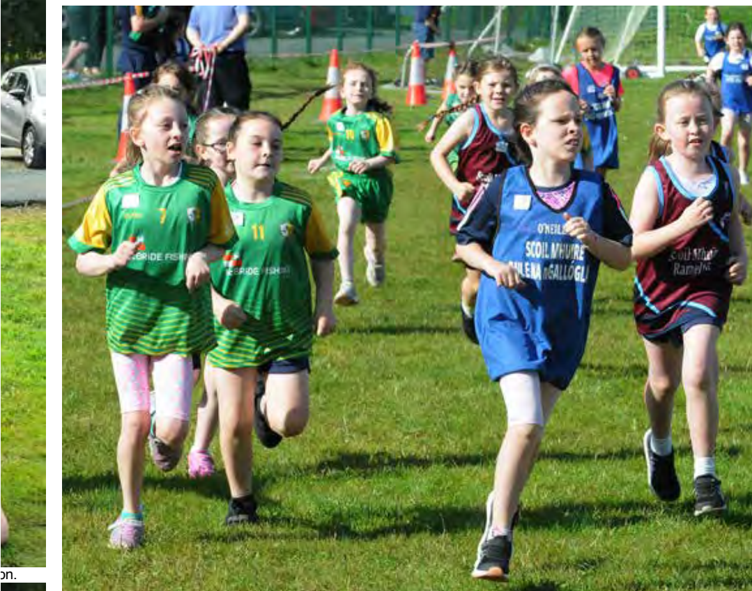
Taking part in the Girls Under 9 race.