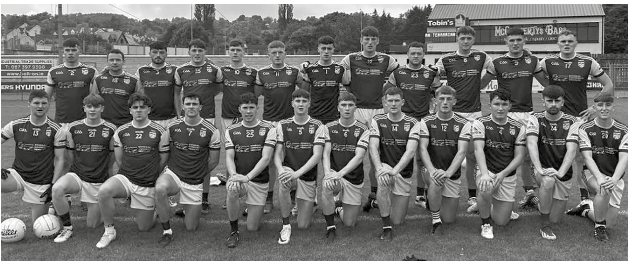
The Termon senior squad prior to Saturday's Intermediate semi-final win over Naomh Mhuire.