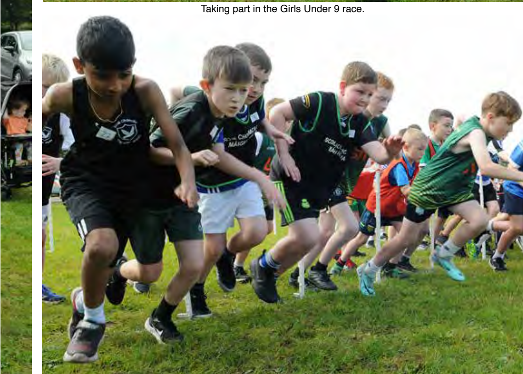
Boys at the start of the U11 cross country race in Milford.