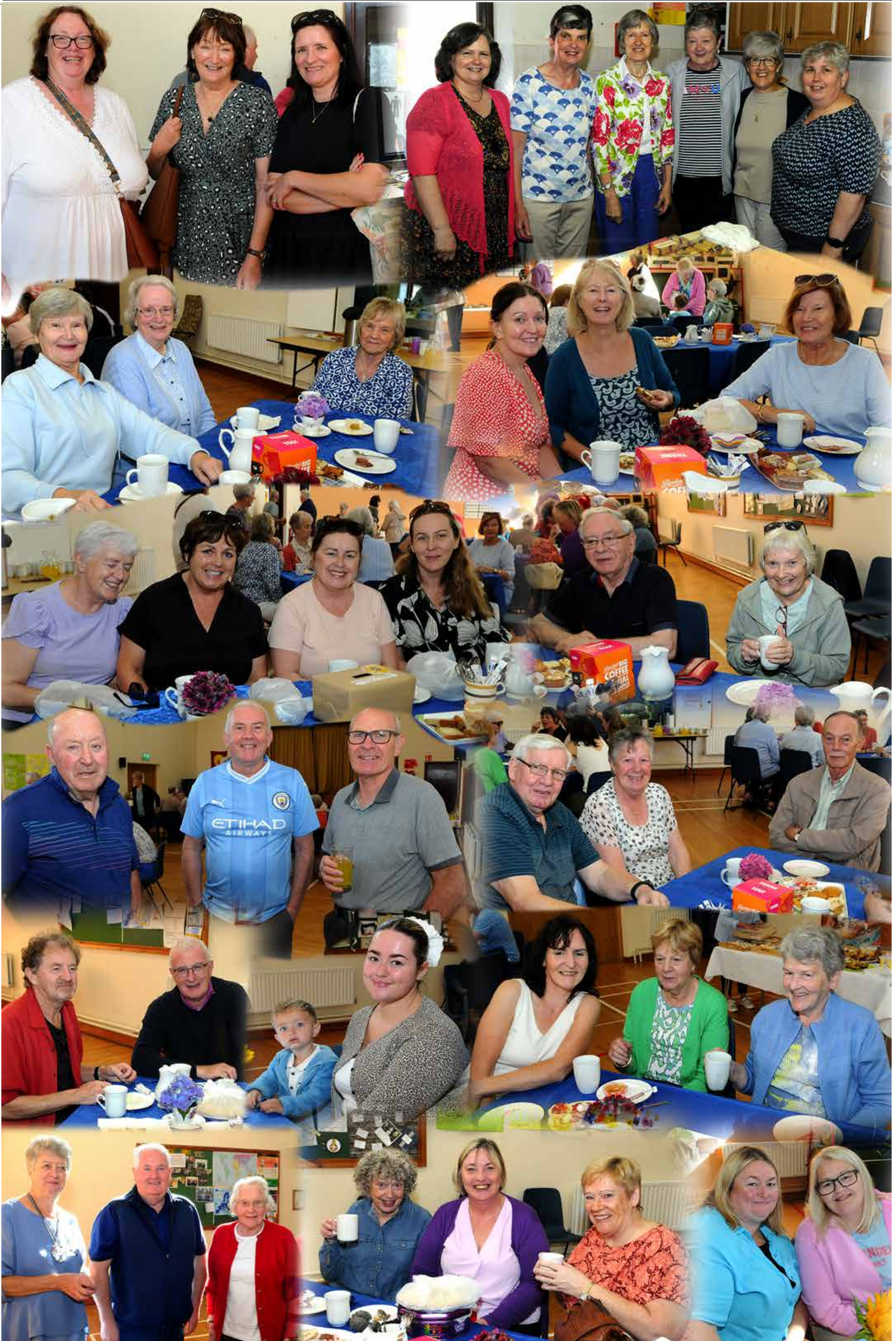
Scenes from the Coffee Morning in the Mackemie Hall, Rameilton on Friday in aid of the Donegal Hospice. They raised a total of €2,155 and they wish to thank everyone for their support.