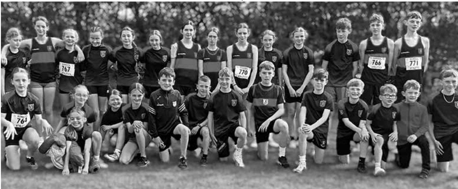
Milford AC juvenile athletes who competed in the County Cross Country Relays in Finn Valley on Sunday.