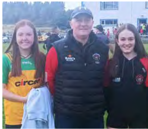
Pictured are St. Michaels GAA Supporters enjoying the Senior teams victory over Kilcar in the County Senior Championship Quarter final in Glenties on Sunday evening.