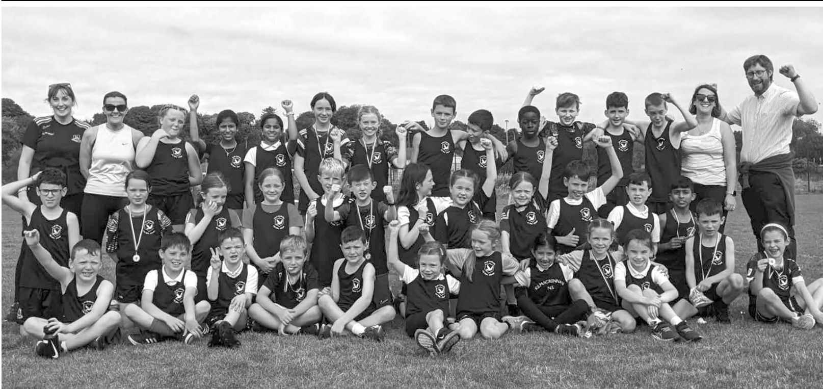
The Kilmacrennan National School team at the Primary Schools Athletics in Milford last week with their teachers.