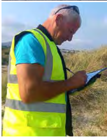
Scenes from the Clean Coast Day in Killyhoey Beach organised by the Dunfanaghy Tidy Towns on Saturday.