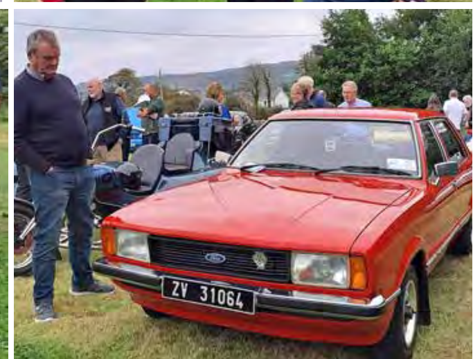
Pictured are scenes from the Cars and Coffee Event held in Dunfanaghy on Sunday afternoon.