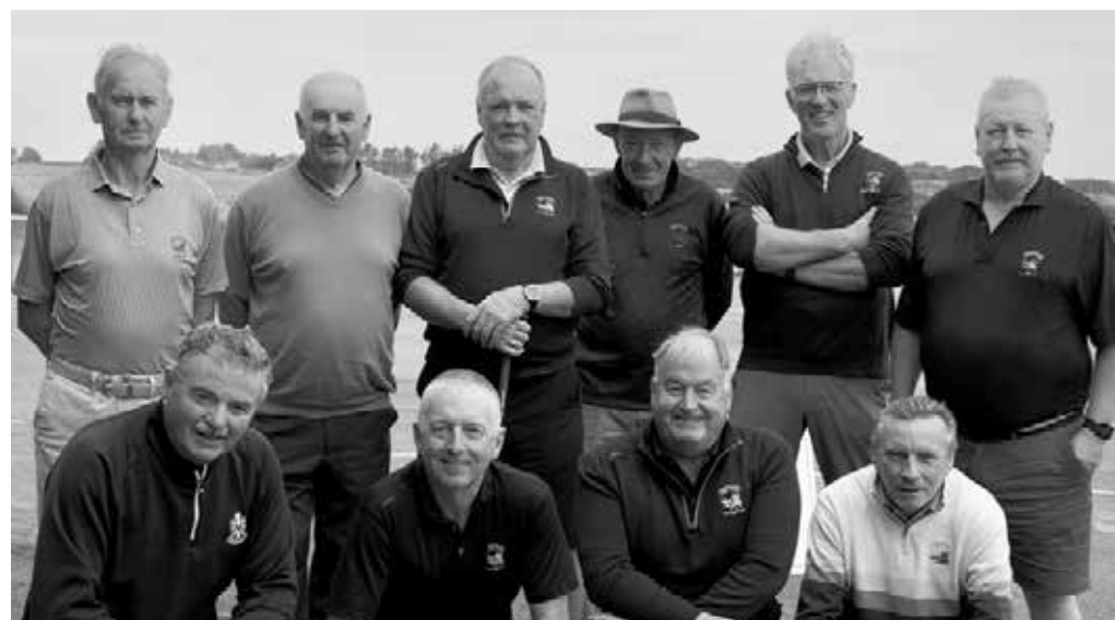
Portsalon Seniors team who were defeated by Cloughaneely Golf Club in the final of the Donegal Seniors on Sunday last.

gles Competition on Saturday 21st September. A fantastic turnout with over 60 golfers playing. Well