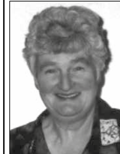
Daisy 24th September 2011 13th Anniversary