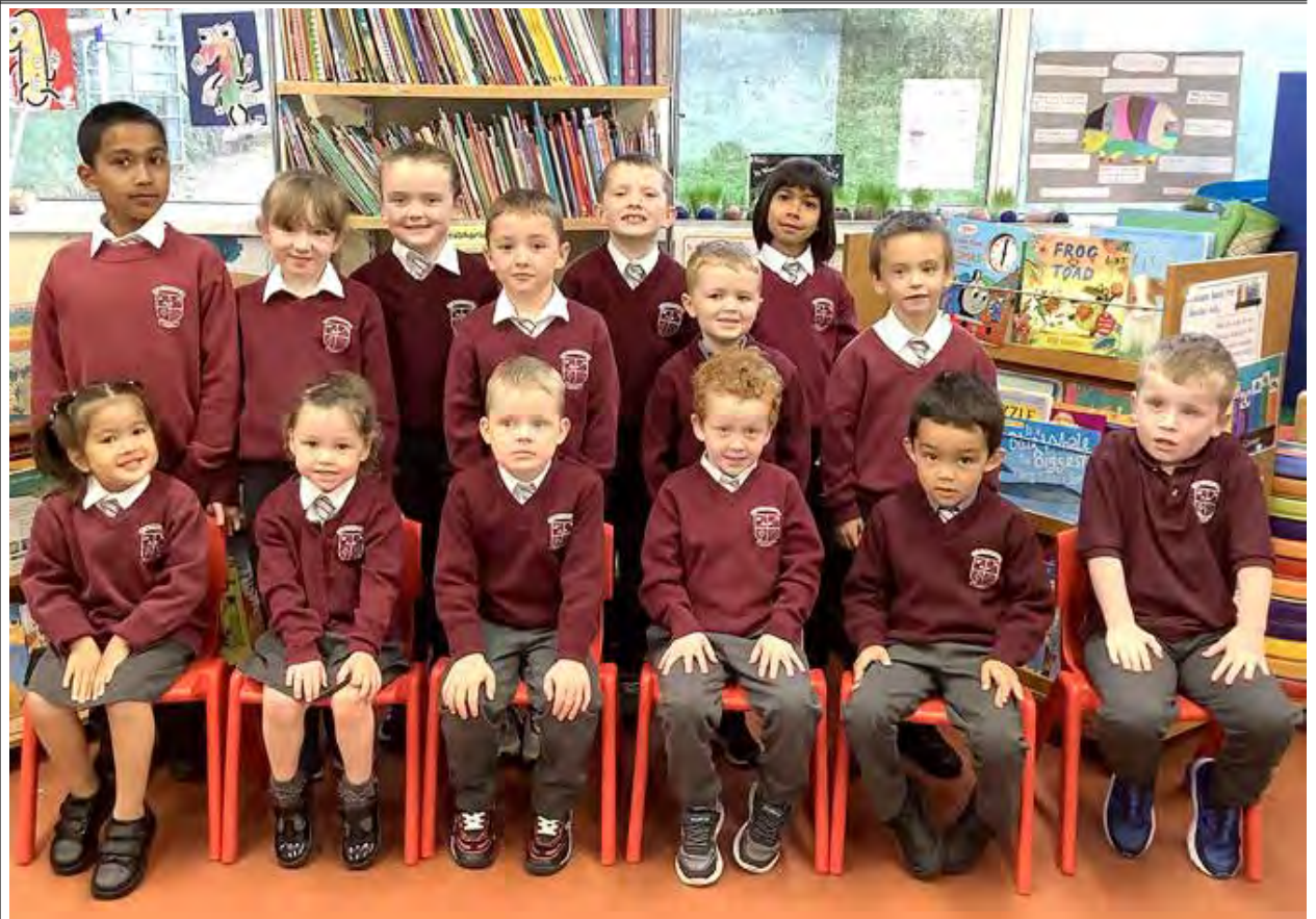
The Junior Room in St. Davaddog's NS Tamney. They welcomed 4 new Junior Infant pupils and a new family who moved to the school.