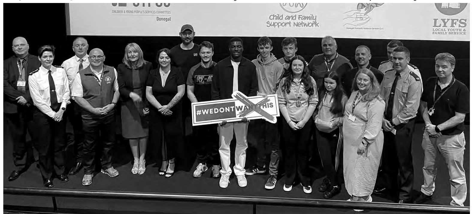
We Don't Want This - Funders and members of the Working Group at the launch in Century Cinemas.