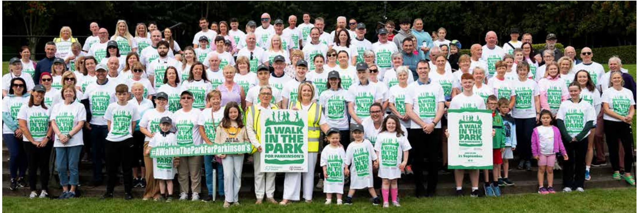
Participants in the 'Walk in the Park for Parkinson's' which took place in Letterkenny Town Park and was supported by Home Instead Donegal.