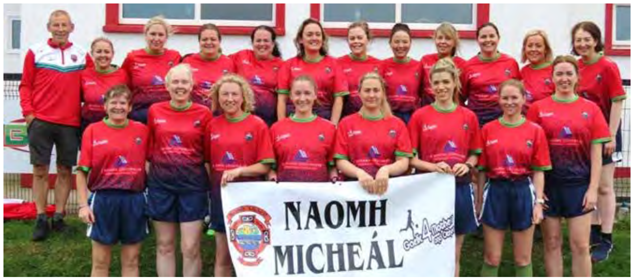
The St. Michael's Gaelic for Mothers and Others Team who played St Mary's, Faughanvale, and Sarsfields, Ballerin at The Bridge on Saturday