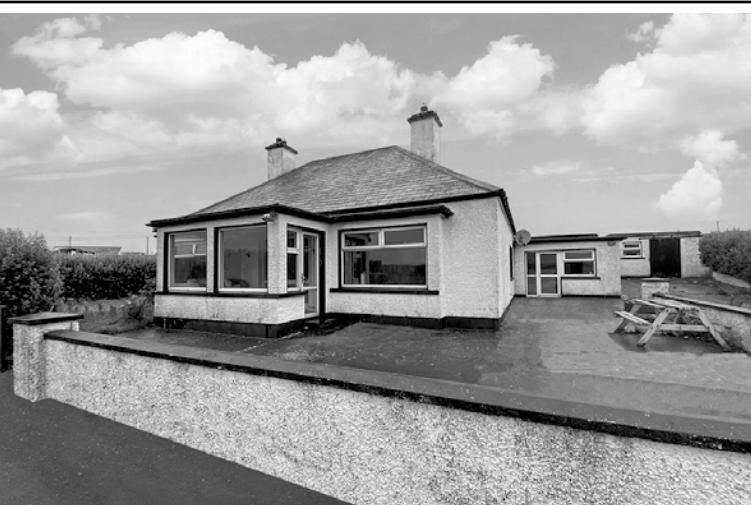
and it is located within walking distance of the White Shore Beach and is described as a refurbishment opportunity.

The next auction is on the 17th of October with houses in Annagry and Letterkenny for sale and of course the Glencolmcille Hotel.