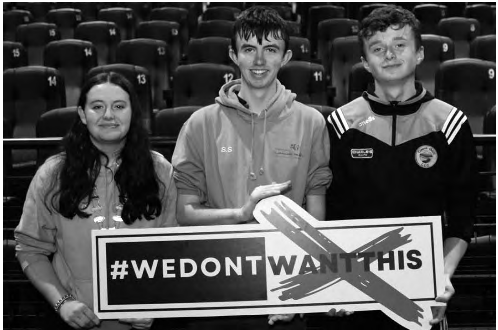
Donegal Youth Council Members at the launch.