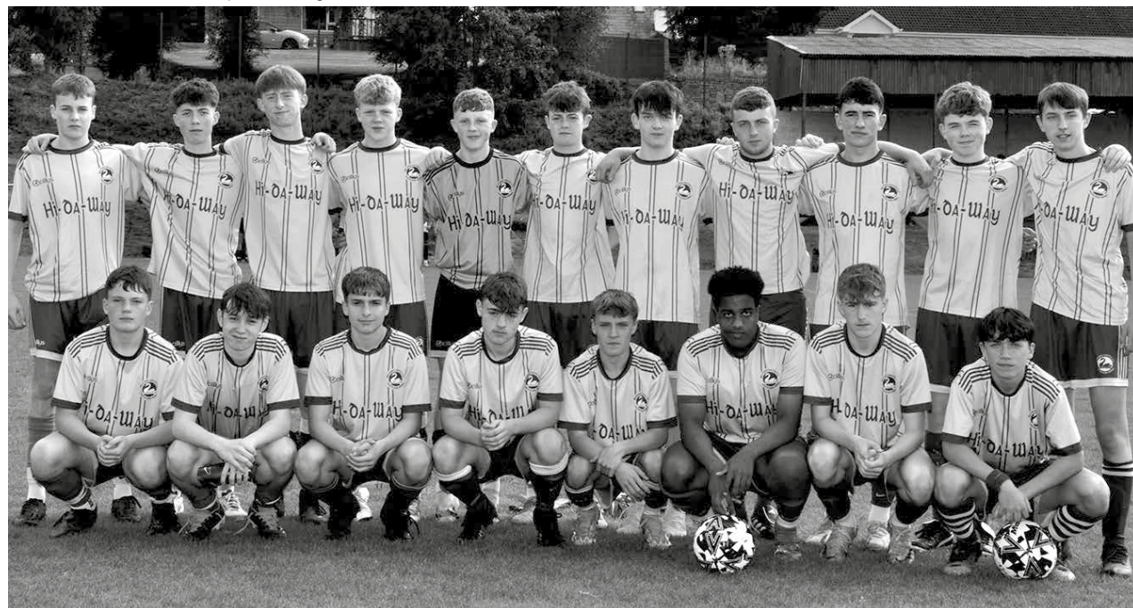
The Milford U16 team who were defeated by Letterkenny Rovers on Sunday in the Donegal Premier Final.